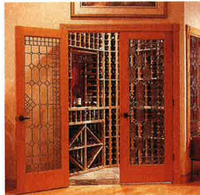
Left: This custom-designed wine room features a red cedar racking system and leaded-glass look doors.

Not interested in dedicating a room to your collection? You could also install a wine cooler for your kitchen or dining area.