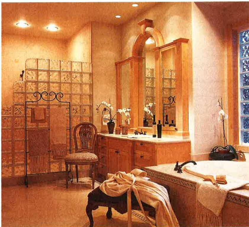
Opposite: In the master bedroom, the fireplace brings warmth when the Seattle weather can't provide a sunny day for enjoying the view. Left: Master bath or decadent spa? An oversize shower gains privacy from a glass block wall, and the generous tub is flanked by custom vanities. A large walk-in closet and the private toilet area complete the experience.