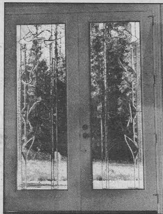
Clear glass that's leaded, beveled and frosted is very trendy for doors and windows.

The Issaquah homes are bigger (3,500 square feet and up) and more expensive — $425,000 to $695,000. They tend to have front