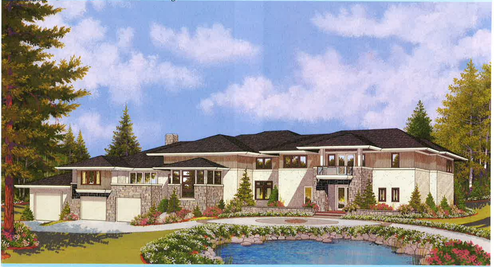
HOUSE ILLUSTRATION AND FLOOR PLANS BY JERRY SMITH