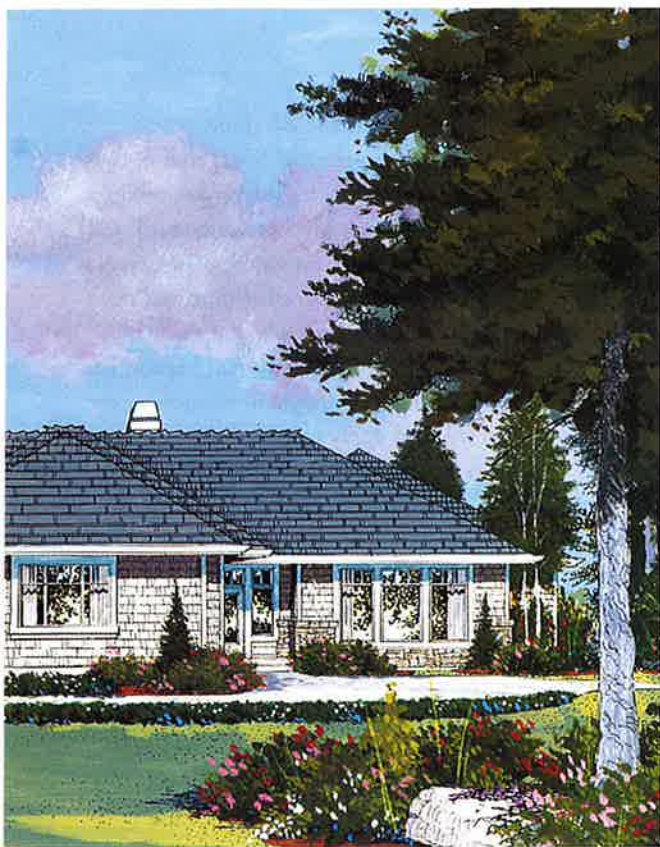
ILLUSTRATION BY J.R. SMITH