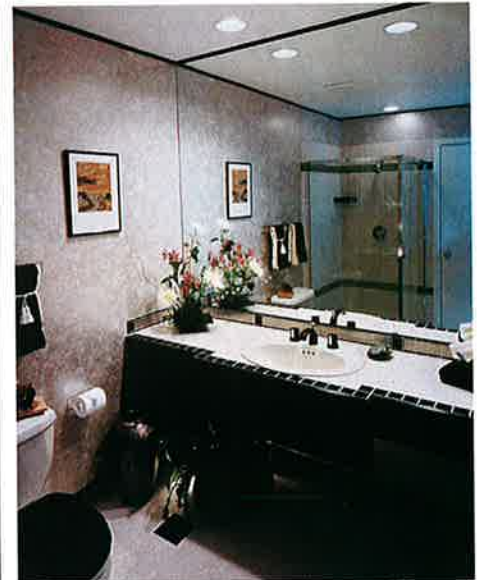
Interior Design by O'Neill-Hanson Design 7981 168th Ave N.E., Redmond, • (206) 881-3100 Furnishings by Foster's Furniture.

O'Neill-Hanson Design is committed to educating the client to design possibilities, presenting cohesive options and overseeing the design